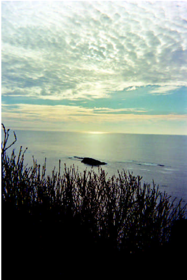
Oregon Coast, near Florence. Thanksgiving weekend.

Since I have no children & I feel a strong urge to keep up the "crazy cat lady" image, I just have to share pics of my "babies".