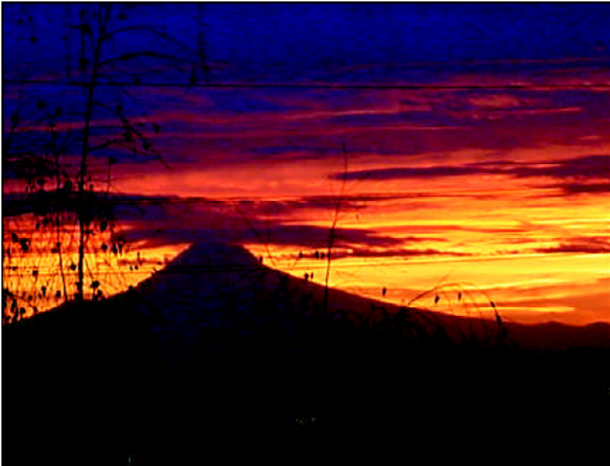
Portland Sunrise silhouetting Mt Hood. View from YMCA track insanely early in the am.